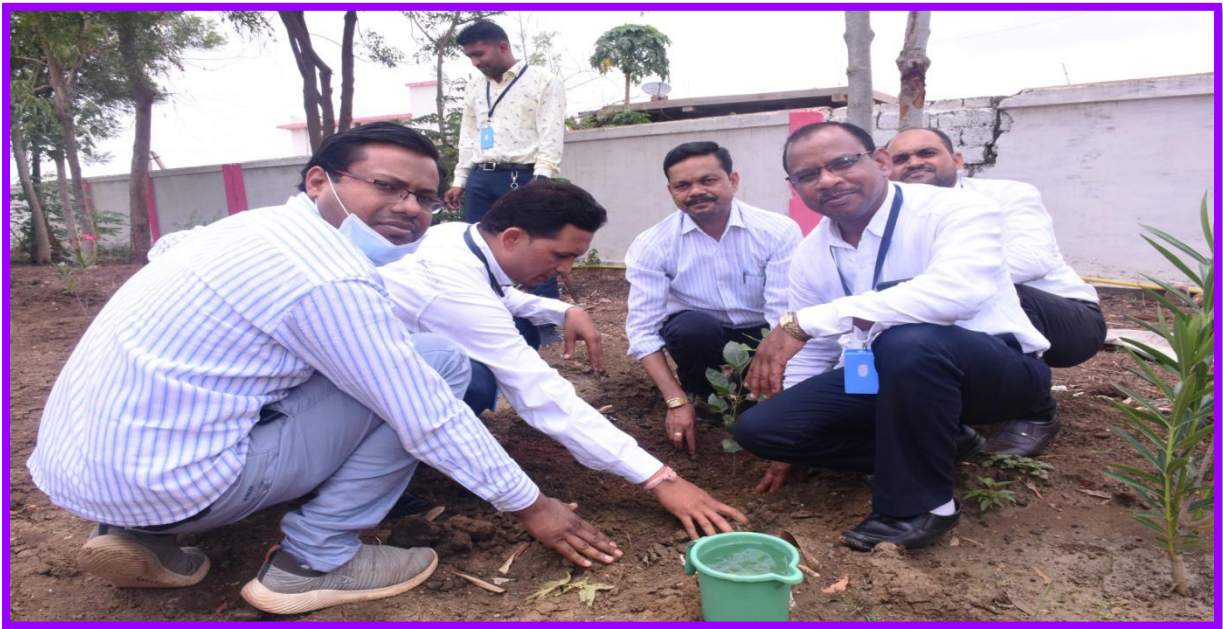
Observation to Playground