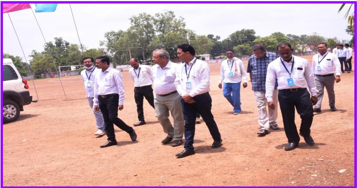
Visit to Gym