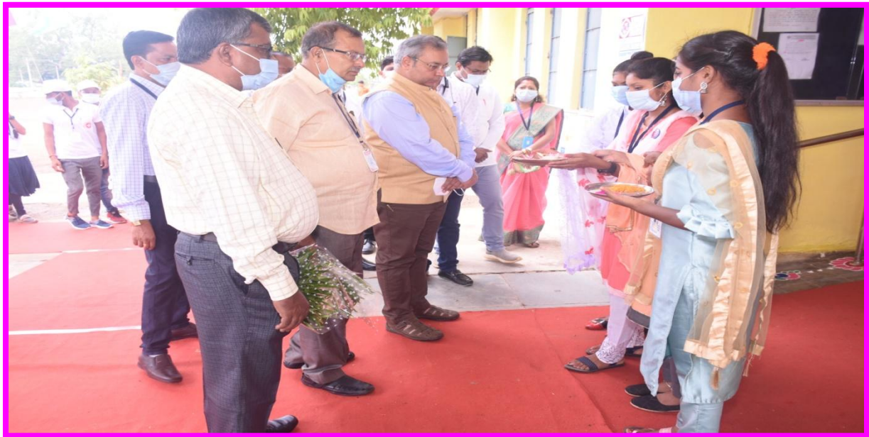
Worship of Maa Saraswati